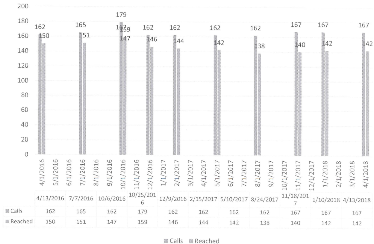
TRPRC One Call Notification Recap 2017